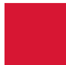
PANTONE 186 U