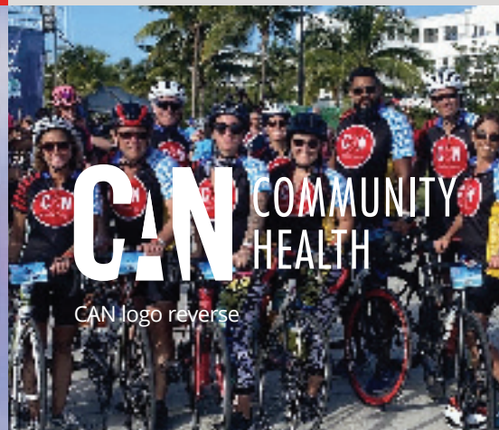
CAN logo reverse